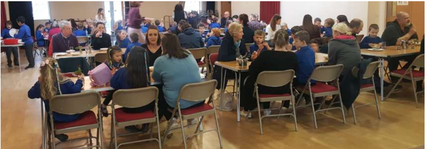
Parent and Community lunch

Parents, carers and members of the local community are welcomed into school life, with invitations to: sharing assemblies, school lunches, seasonal celebrations, helping in the classrooms and after school clubs.