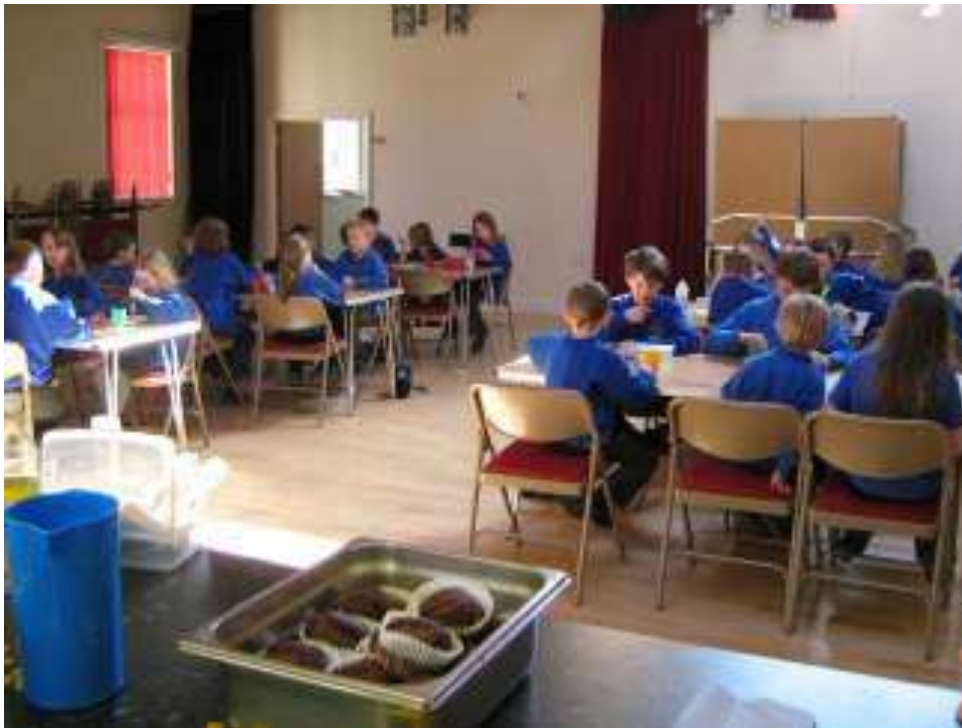
Lunch in the Village Hall

Our school meals are cooked on site. Every day the children are given a choice of main courses and desserts. Parents can pay for school meals using ParentPay, an online payment system that the school currently uses. Alternatively, children may choose to bring a packed lunch to school. We encourage parents to support our Healthy Schools status and ensure that packed lunches are healthy; fizzy drinks, squash, sweets and chocolate bars are not allowed.